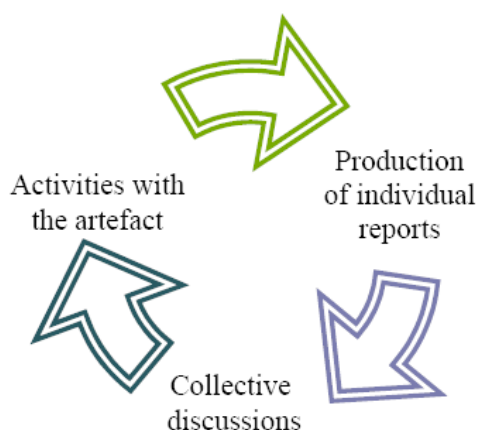
Fig. 1. Didactical Cycle