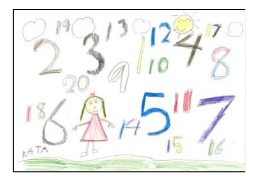
Figure 3: First-grader boy's and first-grader girl's drawings demonstrating huge number productions