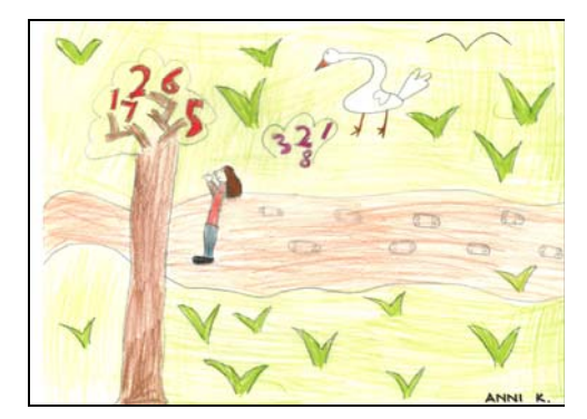
Figure 4: Second-grader boy's and second-grader girl's drawings demonstrating creative use of numbers

These children also are practicing their number sense but in a more creative way than children in figure 3. However, we have to accept that it is difficult to conclude any differences only by the pictures. Concerning to this challenge, we sustained trustworthiness by comparing these differences to children's other responses in our pictorial test, and by finding parallel results.