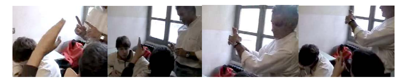
Figure 3: The student's gestures (left pair of pictures) and the teacher's gestures (right pair of pictures)

Please imagine for a moment what the teacher and the student are talking about. How does the student answer the question about the growth of the exponential function for very big x and how does the teacher react? – The student describes his perception of the screen meaning that the graph seems to approximate a vertical straight line. The teacher wants to show that this is wrong because every vertical straight line would be passed by the graph.